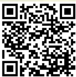
Web of Science